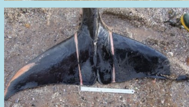
Top photo: A Sowerby's beaked whale chronically entangled in fishing twine. Bottom photo: Linear abrasions on the tail of an acutely entangled minke whale.