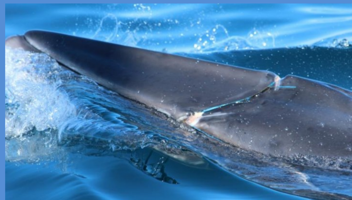
Photo: Minke whale (BW30 taken on 10/07/2010) with fish packing strap embedded round the upper rostrum.

The types of marks varied from those that had extensive tissue damage or deformation associated with entanglement, to less severe linear scars or wounds that wrapped around parts of the body, indicating they may have previously been entangled.