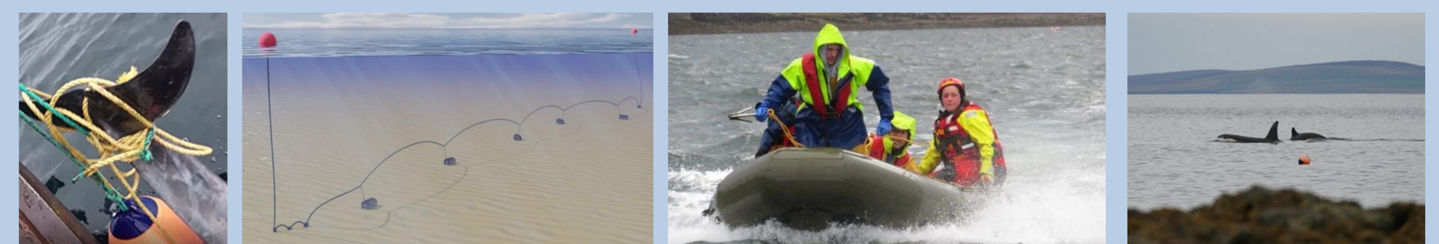
Photos (L - R): Risso's dolphin entangled in creel gear, successfully released alive; set-up of a typical creel fleet; Fishers undertaking disentanglement training; killer whales foraging near creel gear, Shetland.